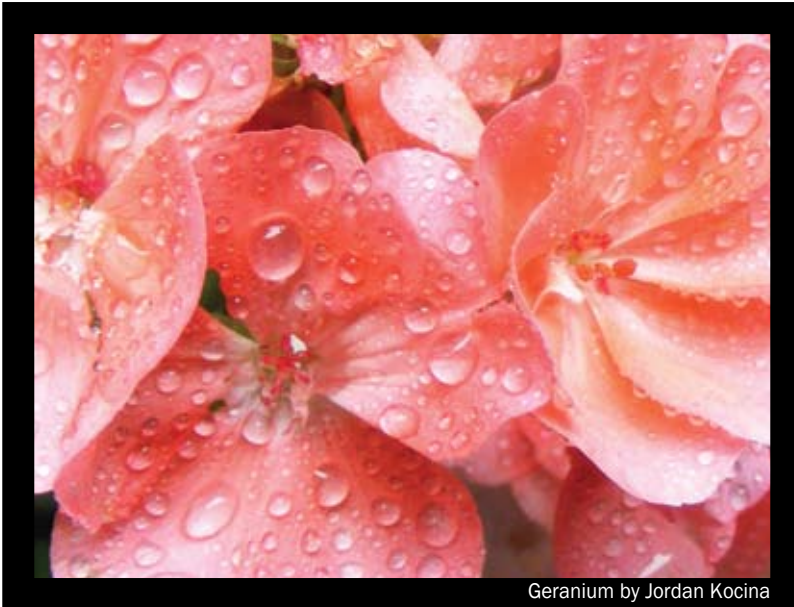
Geranium by Jordan Kocina

LAKE METROPARKS' 23RD ANNUAL amateur photography contest captured the beauty of nature through the art of photography. We graciously acknowledge the support and generosity of the following groups and individuals from around Lake County who made this show possible: