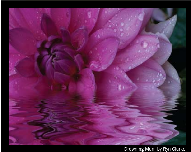
Drowning Mum