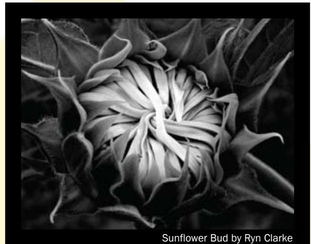
Sunflower Bud by Ryn Clarke