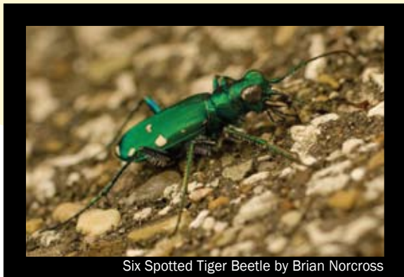
Six Spotted Tiger Beetle by Brian Norcross