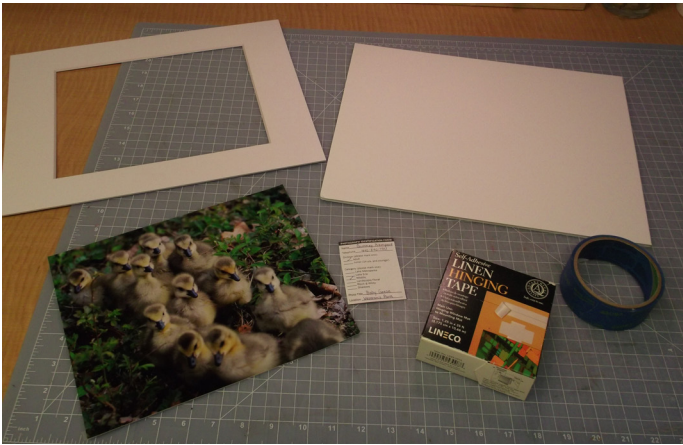
1. Basic supplies: white pre-cut mat, backing board (cardboard or other), photo, photo label, assorted tape.