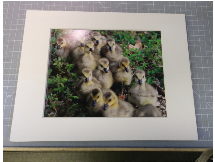
4. Fold the mat down to frame the photo.