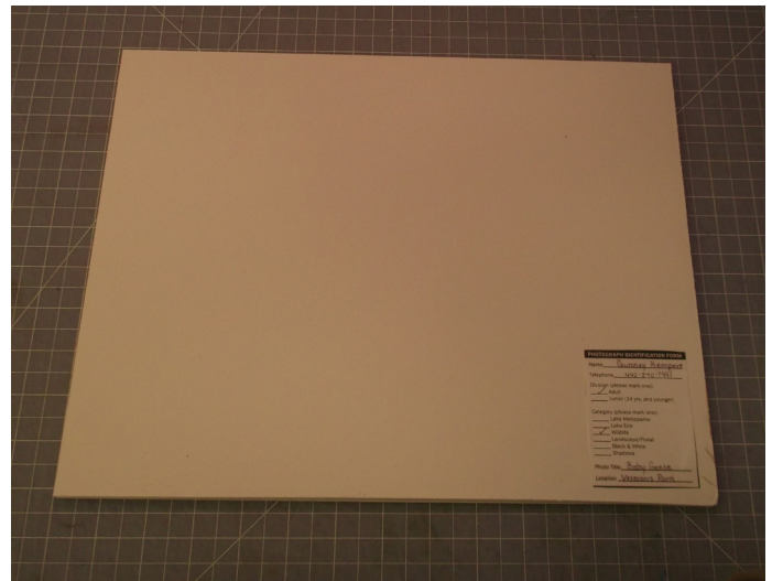
5. Flip matted photo over and affix label to the bottom right using Scotch tape.