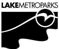
Photo Contest Entry Form

All entries must be received by 4:00 pm, Saturday, May 31, 2025. Include entry fee(s) in exact change or personal check with this form.