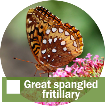
Great spangled fritillary

Most abundant in early summer, there are about 20 species of mason bee in Ohio ranging in color from black and pale yellow to metallic green. Mason bees are solitary and can be found in meadows and forest edges.