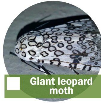
Giant leopard moth

Don't be fooled by the black and yellow markings, this isn't a bee, it's a fly! Hoverflies are bee mimics but can be identified by their larger eyes and two wings (instead of four). Hoverflies are found in nearly every habitat.